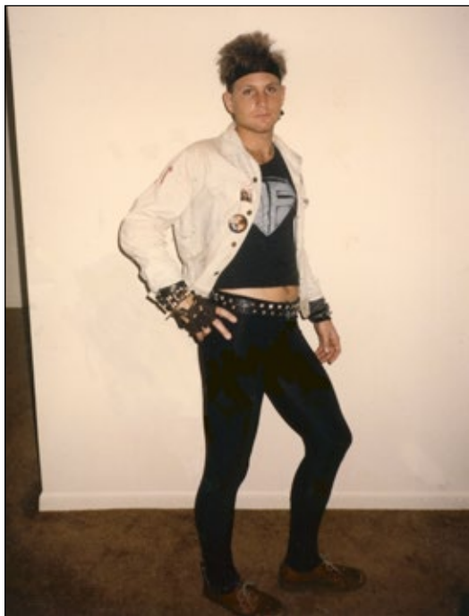
Dressed for my acting debut in the movie, Raw Deal