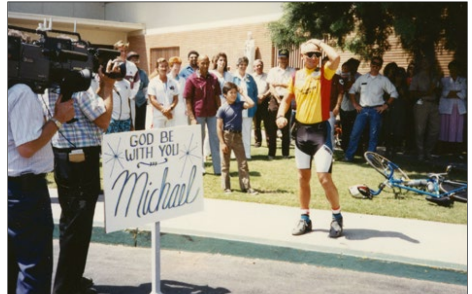
Arriving at our final destination—Daniel Freeman Hospital two months and two weeks after leaving Wilmington, NC, on Ride to Recovery II (1989)