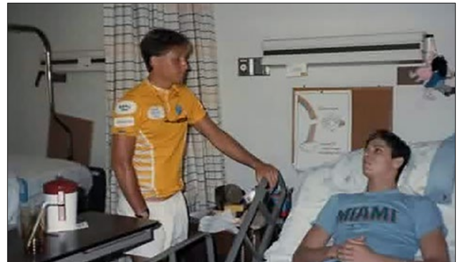
Visiting a patient at Memorial Hospital and Rehab Center, Jacksonville, FL, on Ride to Recovery I (1986)