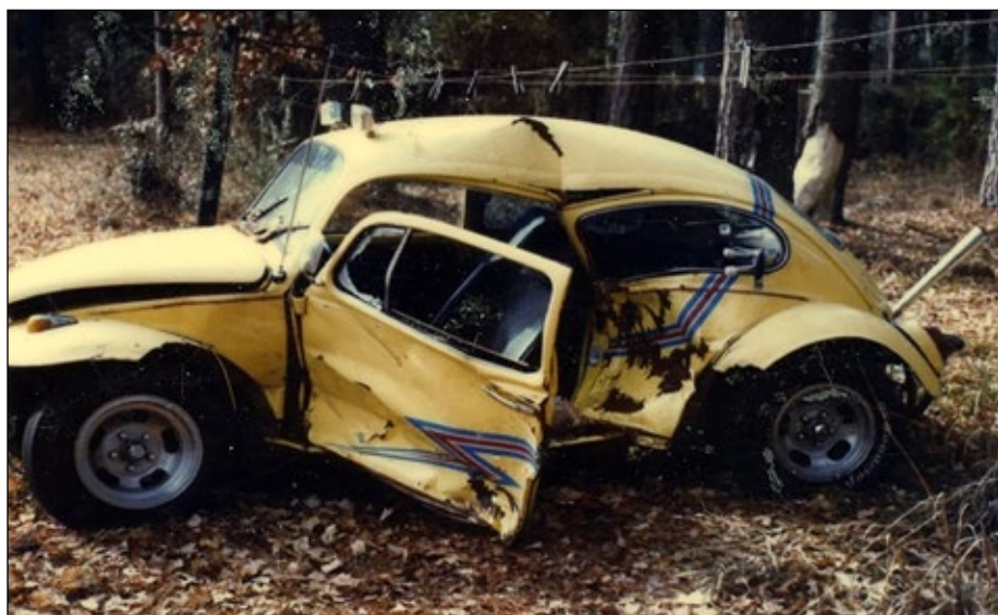
My beloved Baja Bug