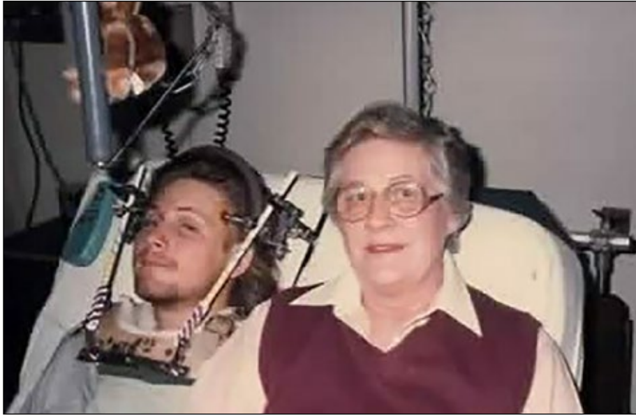
Mama and me