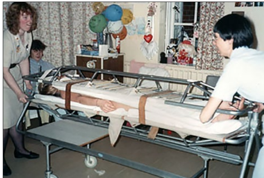
Stryker frame traction bed—no, that's not me