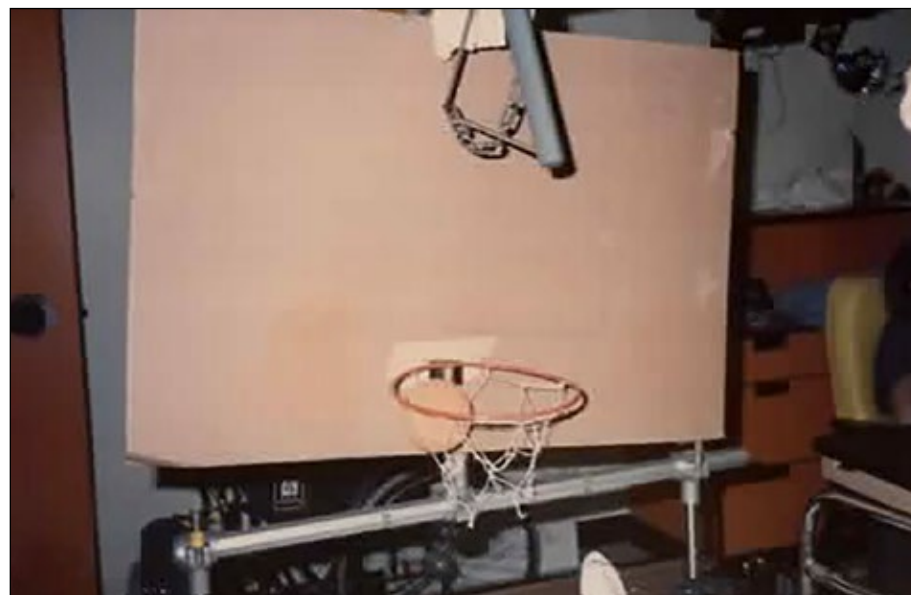
My worn out basketball goal