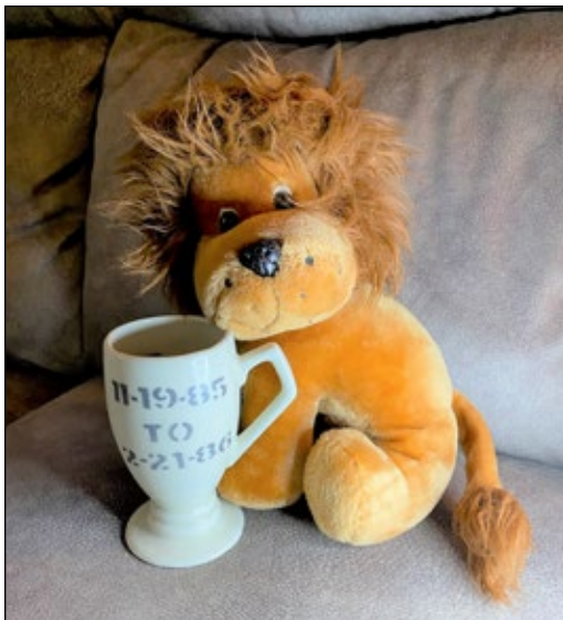
Arnold the Lion and the cup I painted in occupational therapy