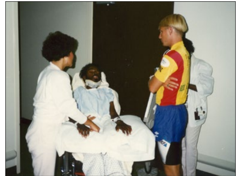
Visiting a newly injured patient at Daniel Freeman Hospital, Inglewood, CA (1989)