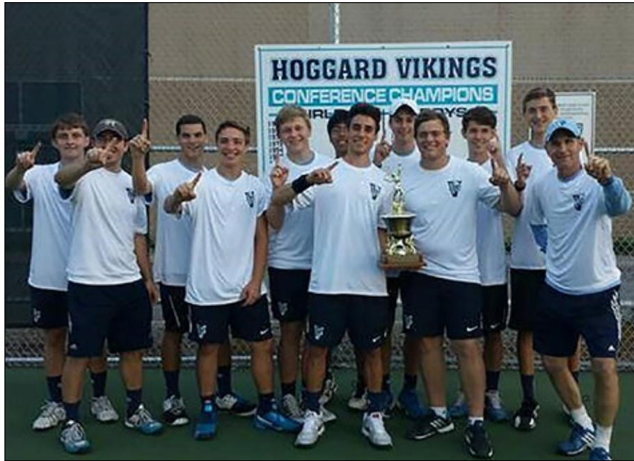
Hoggard Tennis Team (2014)