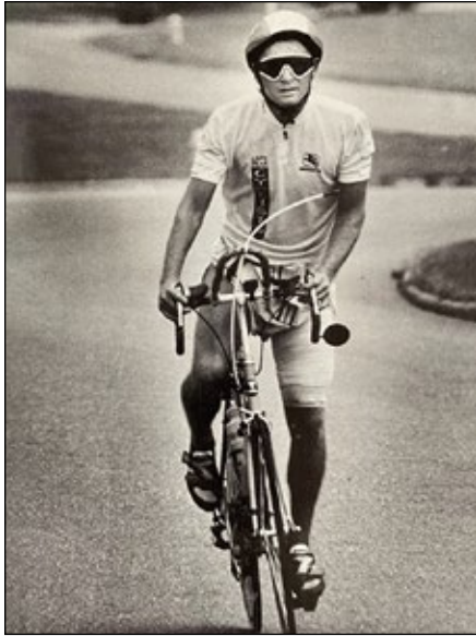
Pedaling uphill to Woodrow Wilson Hospital and Rehab Center, Fishersville, VA, on Ride to Recovery III (1991)