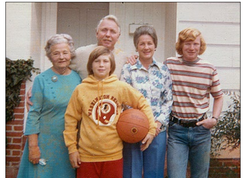
The Bowen Family, Christmas (1974)