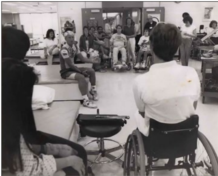
Sharing my story with patients at Cosa Colina Rehab Center, Pomona, CA, on Ride to Recovery II (1989)